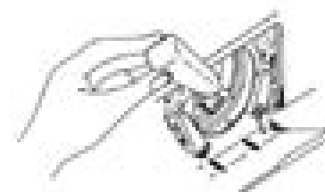
Place a drop of oil in the hook case.