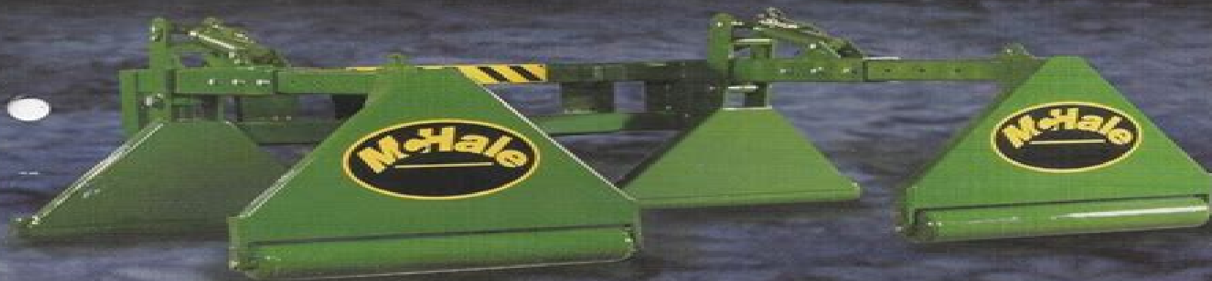
Single Bale Handler