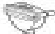
Figure 10-15 Main wire connector with wire nut