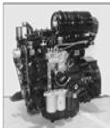
AR1040 INDUSTRIAL ENGINE (View - Fuel Pump Side.)