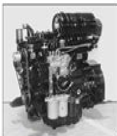
AR1040 INDUSTRIAL ENGINE (View - Fuel Pump Side.)