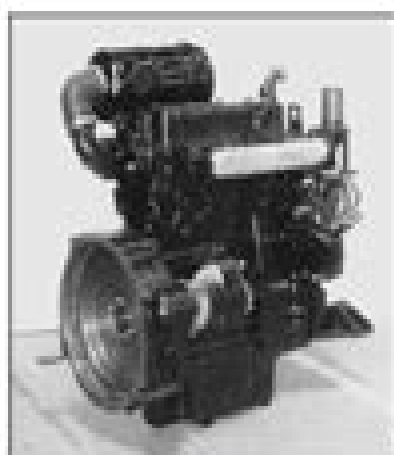
AR1040 INDUSTRIAL ENGINE (View - Exhaust Manifold Side.)