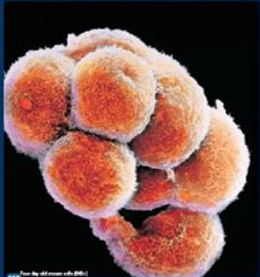
4-day old mouse cells

Cells must copy their chromosomes and divide properly in order to make new cells that function properly