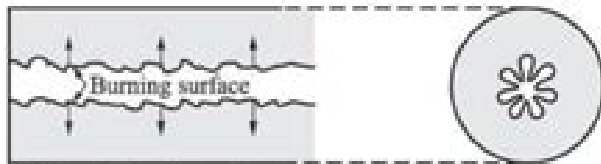
Internal star-shaped burning surface