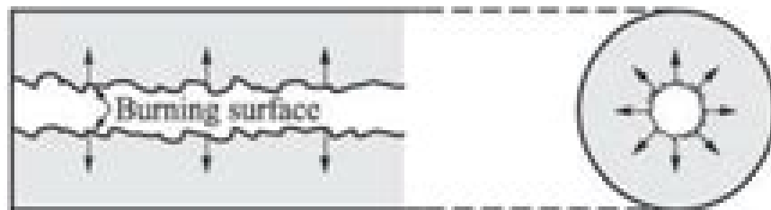
Internal bore burning surface