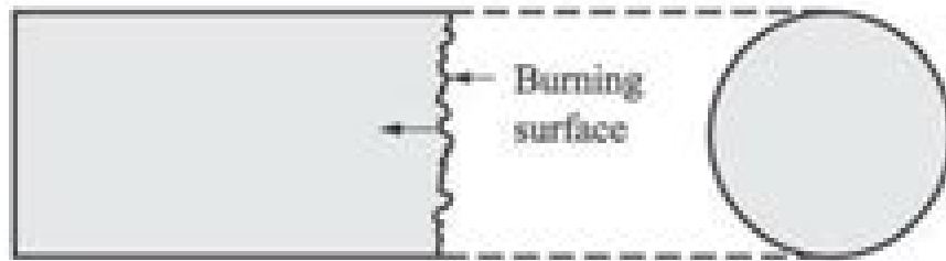
End-burning surface configuration