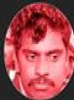
2007 Nithari serial killings