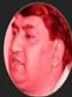
2003 In Telgi stamp paper scam