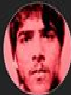
2008 November 26 Mumbai terror attacks