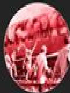
2002 Godhra carnage case

Some well-known cases in which narco-analysis was used