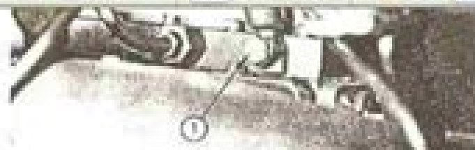
Fig. 65 — Injection Pump Front — MF 1155