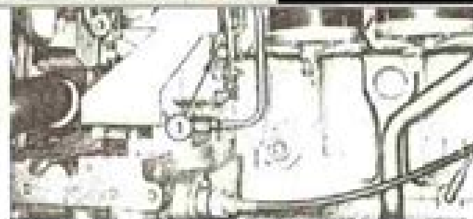
Fig. 68 — Low Idle Adjustment — MF 1105/MF 1135