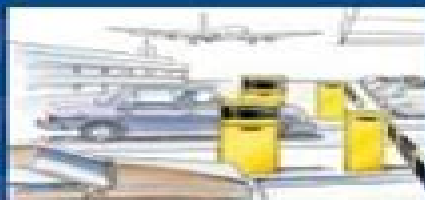
Complete lane management