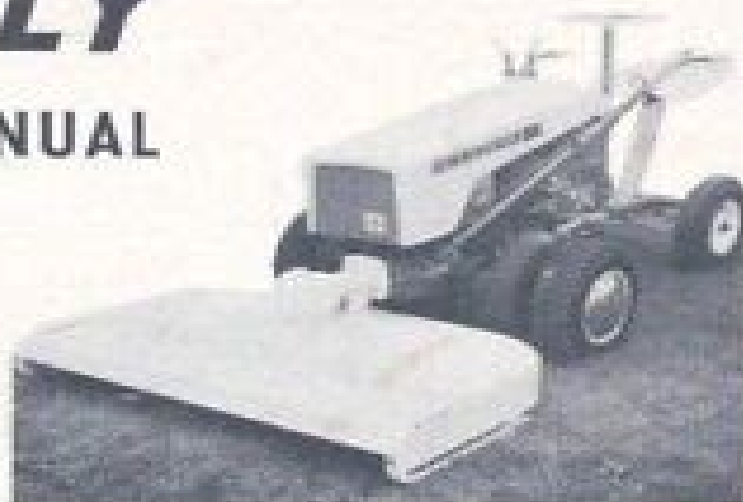
Gravely Super Tractor, 4 Steering Wheel, 40-inch Battery, 1000