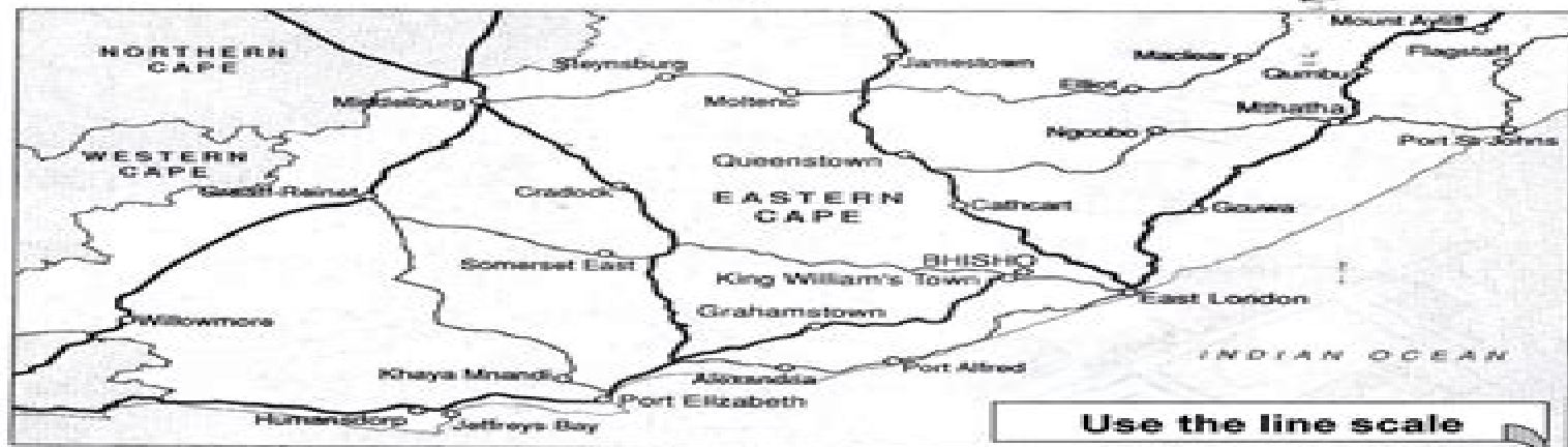
Figure 2: A map of the Eastern Cape

We can also give the scale in words, for example one centimetre on the map represents one kilometre on the ground. This is a word scale.