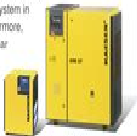
Series: SX - ASK

The SIGMA CONTROL basic is available with KAESER's SX, SM, SK and ASK series rotary screw compressors. It is the perfect solution for users who initially require a single compressor for their air supply, but who also may wish to expand the compressed air system in the future. Furthermore, KAESER's modular control and compressed air management concept ensures trouble-free system compatibility.