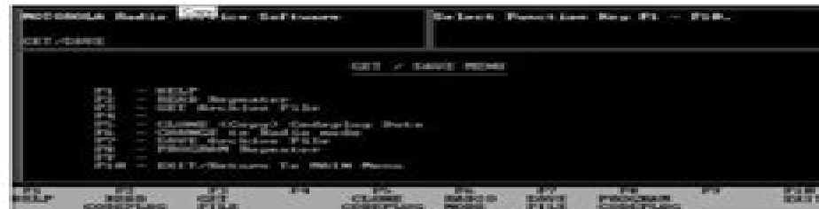
Figure 6-2. Get/Save, Repeater Mode

You will see the Get/Save Screen, Repeater Mode (Figure 6-2)