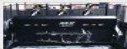
MULTIPLE ROBOT CONTROL