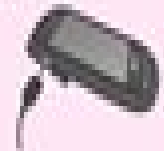
3. Battery compartment