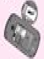
1. Insert the SIM card