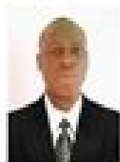
Docteur en droit public en droit public à l'Université d'Abomey Calavi Bénin. Spécialiste du droit international.

Les entreprises multinationales sont devenues des acteurs clés du nouvel ordre mondial économique. Leur nombre et puissance ne cessent de s'amplifier dans l'ordre international contemporain. Face à cette montée, un débat a commencé par faire rage. Il s'agit de savoir quel est leur statut exacte droit international ? Deux tendances s'opposent en droit international quant au statut juridique international des entreprises multinationales. Il s'agit de la tendance minimaliste et maximaliste. À la fin, du débat opposant l'opinion minimaliste et maximaliste, nous avons constaté que les entreprises multinationales sont en réalité dans un vide juridique international. Aucun traité de droit international ne s'intéresse. Les rares textes internationaux qui les concernent ne sont pas contraignants. Le constant est que les États n'ont vraiment pas la volonté d'adopter des normes dures à leur égard, mais aussi la pression exercée par certaines entreprises multinationales (EMN). Mais ce vide juridique ne veut pas forcément dire qu'elle sont complètement absentes devant le droit international. Elles sont prises en compte par le droit international d'une autre manière.