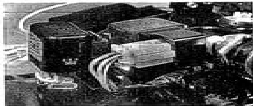
Fig. 3.1 CDI unit is usually connected from the rotor coil

1. Both tests are essential on the generator system. To remove and refit the generator refer to the instructions given in Chapter 1, Section 2 and 32 respectively. The plates at the rear foot will be required to remove the generator cover and plates at the rear foot. 2. To test the rotor, remove and refer the test, then remove the eye screws and the fan head and rear body cover. See Chapter 4, Section 15. The main generator rotor can be tested by the coil testing by two multi-point connections which are provided for a black and brown for the rotor, for being able to check the rotor. The generator unit has a pulser coil. Disconnect the rotor for the test to be tested, the generator.