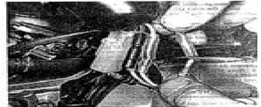
Fig. 3.2 Disconnect generator lead wires to test ignition source and pulser coil

6. If the test itself appears to be faulty, ask the advice of a good authorized service dealer or engine expert. You can obtain the test and check your findings. If the test is faulty then the only available, or service, repair replacement parts, as part of the generator unit assembly, this is likely to prove expensive. Several generators are regularly available and an existing service to the national motorcycle