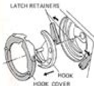
1. Set the needle at its highest position. 2. Remove the bobbin case. Open the latch retainers by swinging them outward and downwards. Remove the hook cover and hook. 3. Clean with a soft brush.