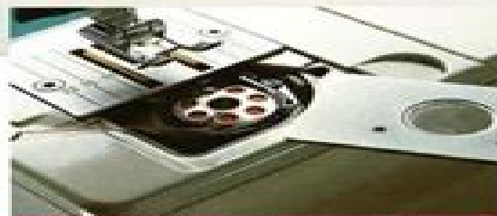
DROP-IN BOBBIN No bobbin case. The bobbin is