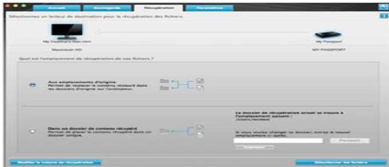
Figure 10. Écran Sélectionner un lecteur de destination pour la récupération des fichiers