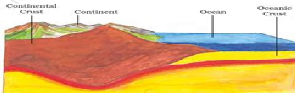
Fig. 2.2: Continental Crust and Oceanic Crust