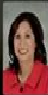
HILDA L. SOLIS CHAIR FIRST DISTRICT