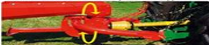
The Gyrodine swivel hitch: 540 or 1000 min -1