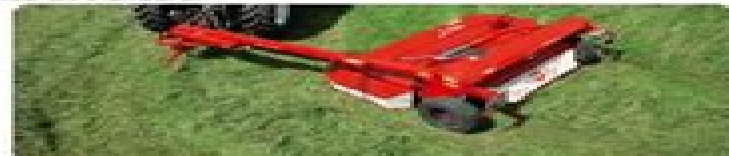
Controlled mowing on turns