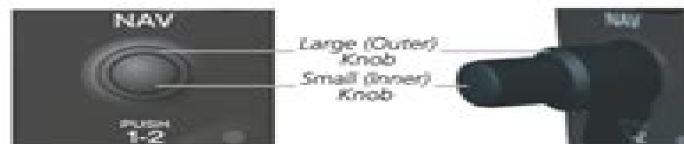
Figure 1-3 Dual Concentric Knob

The NAV , CRS/BARO , COM , FMS , and ALT Knobs are concentric dual knobs, each having small (inner) and large (outer) control portion. When a portion of the knob is not specified in the text, either may be used.