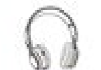
Headset with Microphone