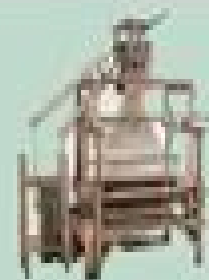
Jacquard Loom (1804)