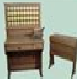
Census Machine (1889)