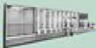
Mark I (1944)