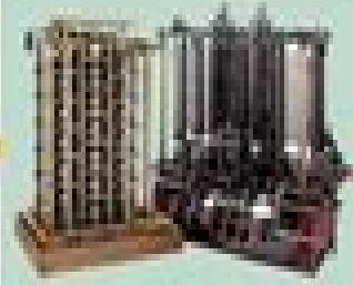
Analytical Engine (1833)