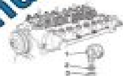
Fig. 4 Rocker shaft oil supply unit

20. The rocker shaft must be dismantled in the sequence shown in: