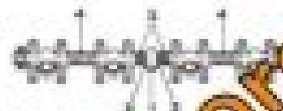
Fig. 4 Rocker shaft

Sealing the cover to the cylinder head is achieved by applying a thin layer of RTV to the gasket surface. Temperature fluctuations cause the entire length of the mating surfaces. Grease is applied to each bearing groove, except collecting onto the bearing surfaces; ensure the old gasket is cleared out before applying the new sealant.