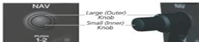
Figure 1-3 Dual Concentric Knob

The NAV , CRS/BARO , COM , FMS , and ALT Knobs are concentric dual knobs, each having small (inner) and large (outer) control portion. When a portion of the knob is not specified in the text, either may be used.