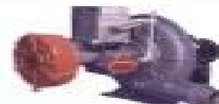
PREMIX™ Blower Mixers (see catalog bulletin 3100)

Air/gas premixing equipment used to provide thorough blending of air/gas mixture to Maxon Burner Nozzles