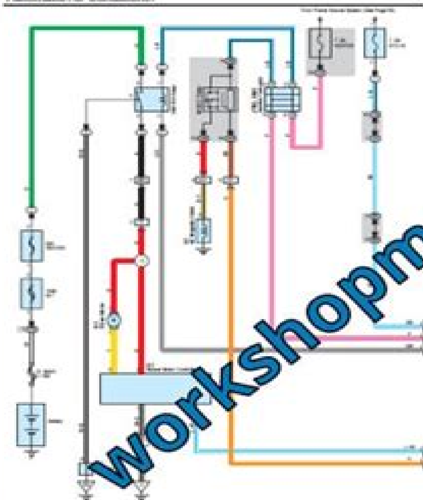
Automatic Air Conditioner