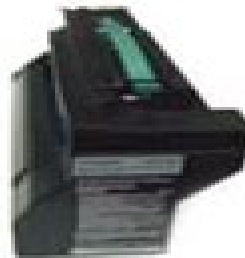
SIDE VIEW WASTE HOPPER