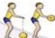
Bounce and catch a ball 3 times