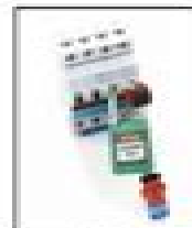
Fig. - 1