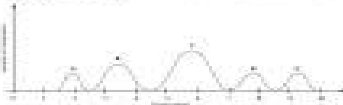
Figure 1-2: A line graph showing a periodic wave pattern with peaks and troughs.

Figure 1-1: A diagram showing a curved line graph with a shaded area under it, and a 3D box labeled 'Box'.