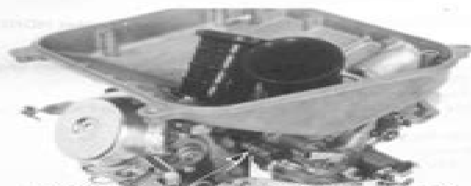
(4) CARBURETOR IDENTIFICATION NUMBER

The engine serial number is stamped on the right side of the crankcase.