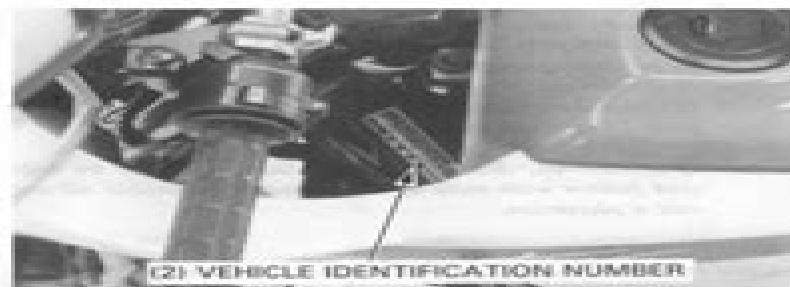
(2) VEHICLE IDENTIFICATION NUMBER

The frame serial number is stamped on the right side of the steering head.