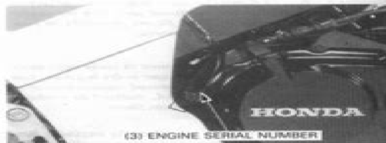
(3) ENGINE SERIAL NUMBER

The vehicle identification number (VIN) is attached on the left side of the steering head.