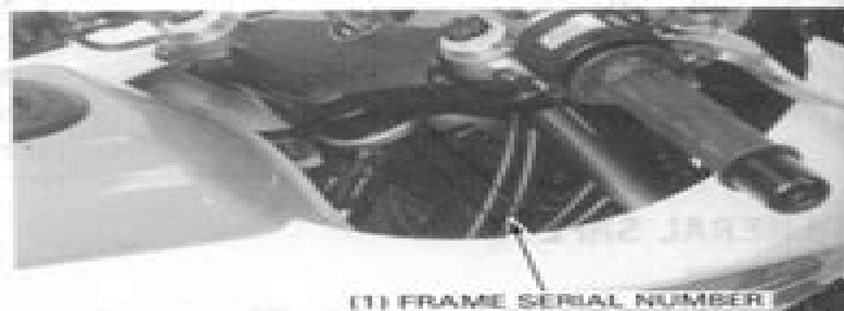
(1) FRAME SERIAL NUMBER

The frame serial number is stamped on the right side of the steering head.