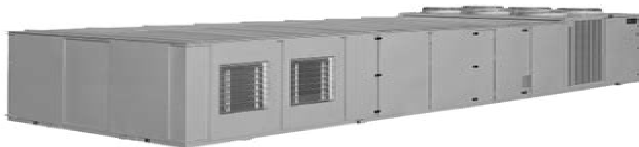
20 - 75 Tons

IntelliPak™ Rooftops 20 - 130 Tons — 60 Hz