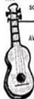
AVERAGE NUMBER OF SONGS REHEARSED