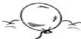
A blown up balloon.