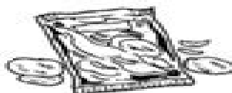
A packet of clips.