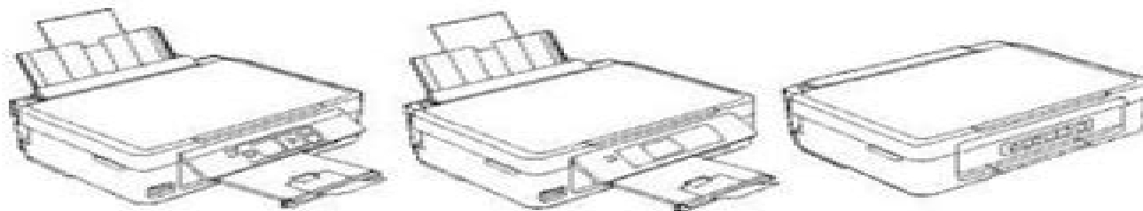
Color Inkjet Printer

XP-430/XP-434/XP-431/XP-231/XP-330/XP-334/XP-432/XP-435/ XP-235/XP-235A/XP-332/XP-332A/XP-335/XP-440/XP-441/XP- 446/XP-240/XP-241/XP-340/XP-344/XP-442/XP-445/XP-243/XP- 245/XP-247/XP-342/XP-343/XP-345