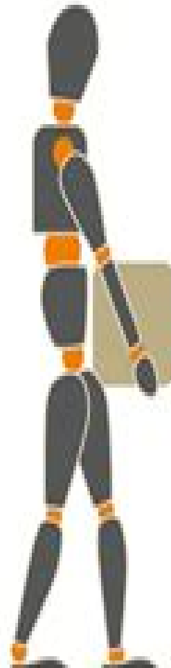
Move the feet