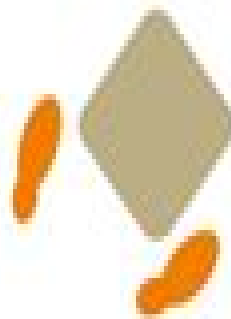
Position the feet