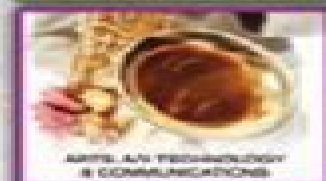
ARTS, A/V TECHNOLOGY & COMMUNICATIONS