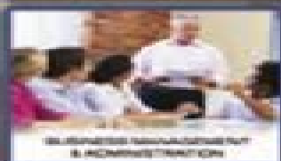
BUSINESS MANAGEMENT & ADMINISTRATION