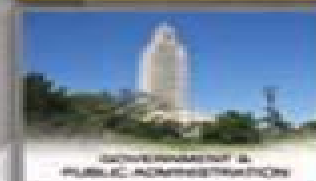
GOVERNMENT & PUBLIC ADMINISTRATION