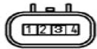
C518-1,2,3,4 IG Coil #1,2,3,4