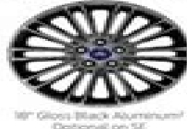
16" Gloss Black Aluminum† Optional on SE