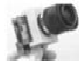
1 Vision sensor USB