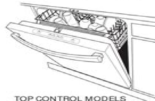
TOP CONTROL MODELS

La sección en español empieza en la página 65