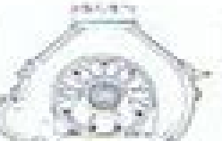
Ford 1A, 209, 302, 351C, 351W