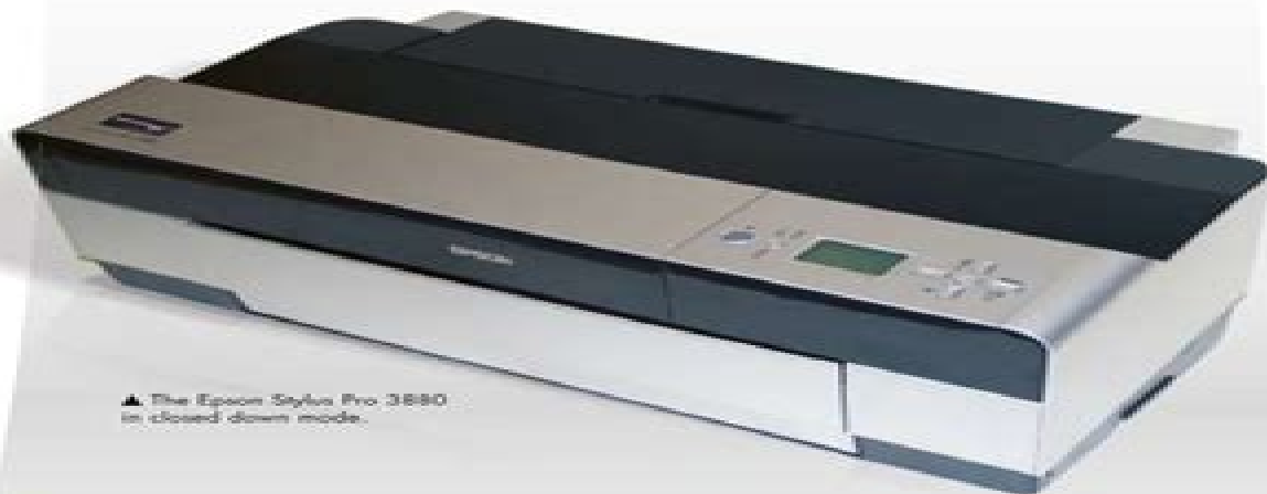
▲ The Epson Stylus Pro 3880 in closed down mode.

The desktop-sized A2 format 3800 was a huge success with photographers who have lowish printing volume requirements so its replacement has a lot to live up to. Report by Trevorn Dawes.