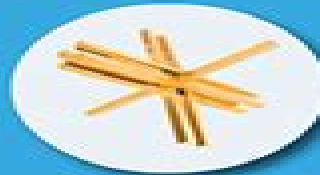
Kern aus doppelungen (1968)