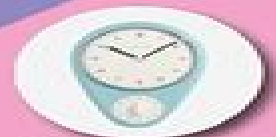
Horloge de cuisine