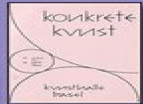
konkrete kunst (1944)