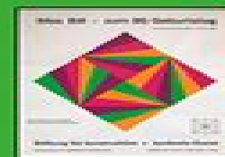
50 ans de Max Bill (1988)

Sculptures Max Bill se conçoit avant tout comme un théoricien de la forme et envisage une approche mathématique de l'art. Il refuse de « prendre appui sur la nature sensible ou sur la transformation de celle-ci ». Il veut intégrer l'art à l'environnement. Ses peintures, ses sculptures sont des structures géométriques. Tout au long de son œuvre, il réalise « des continuités de variations sur un même thème » : bande de Möbius, carrés, sphères ou cylindres. En 1936, il pose l'art concret : « Concret est le contraire d'abstrait : l'art figuratif est abstrait de la réalité, tandis que l'art non-figuratif, qui est une pure création de l'esprit, devient concret par sa matérialisation, comme une chose existant dans la réalité ». Dès le début des années quarante, il aborde la recherche picturale sur le carré et les autres figures géométriques. À partir des années cinquante, il est attribuaire de nombreuses commandes publiques et réalise ponts, pavillons, mobilier ou structures urbaines et jardins suivant les lois de l'Art concret qu'il voit comme « l'expression pure de la mesure et de lois harmonieuses ». Littérature Horlogerie Typographies Peintures Mobilier Affiches