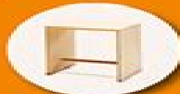
Ulmer Hocker (1954)