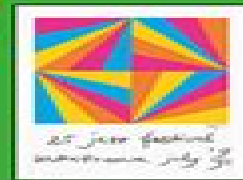
Montreux Jazz (1997)