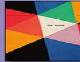
die farbe (1944)