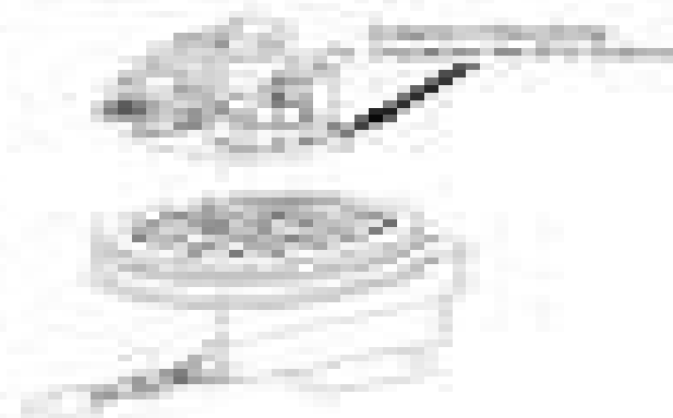
Diagram illustrating the challenges of Reinforcement Learning: The curse of dimensionality and the exploration-exploitation trade-off.

Reinforcement learning is a challenging task because the agent must learn to maximize its reward over time, despite the fact that it only receives a scalar reward signal.